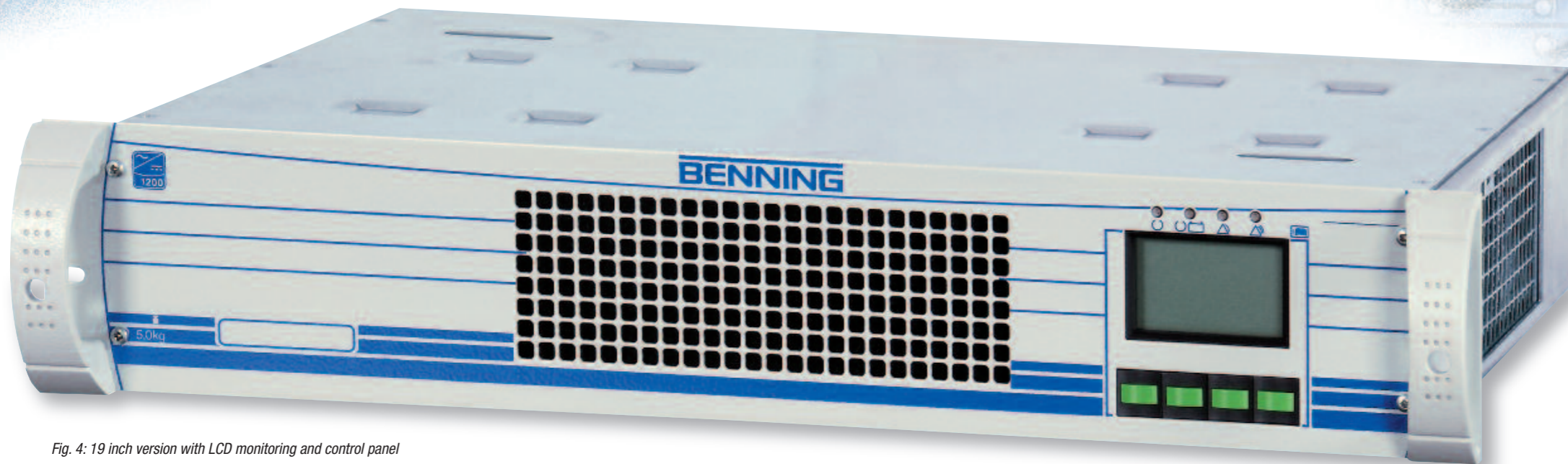
Fig. 4: 19 inch version with LCD monitoring and control panel