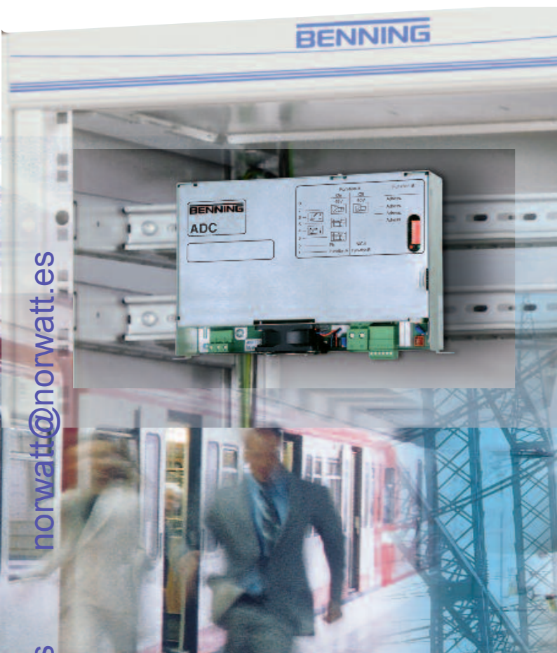
Fig. 3: Floor cabinet with built-in ADC module