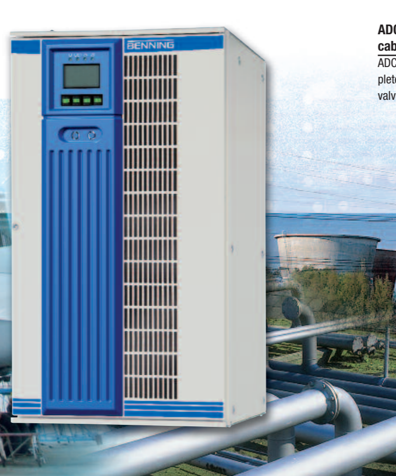
Fig. 6: ADC wall cabinet II with LCD monitoring and control panel (max. output power 2400 W)