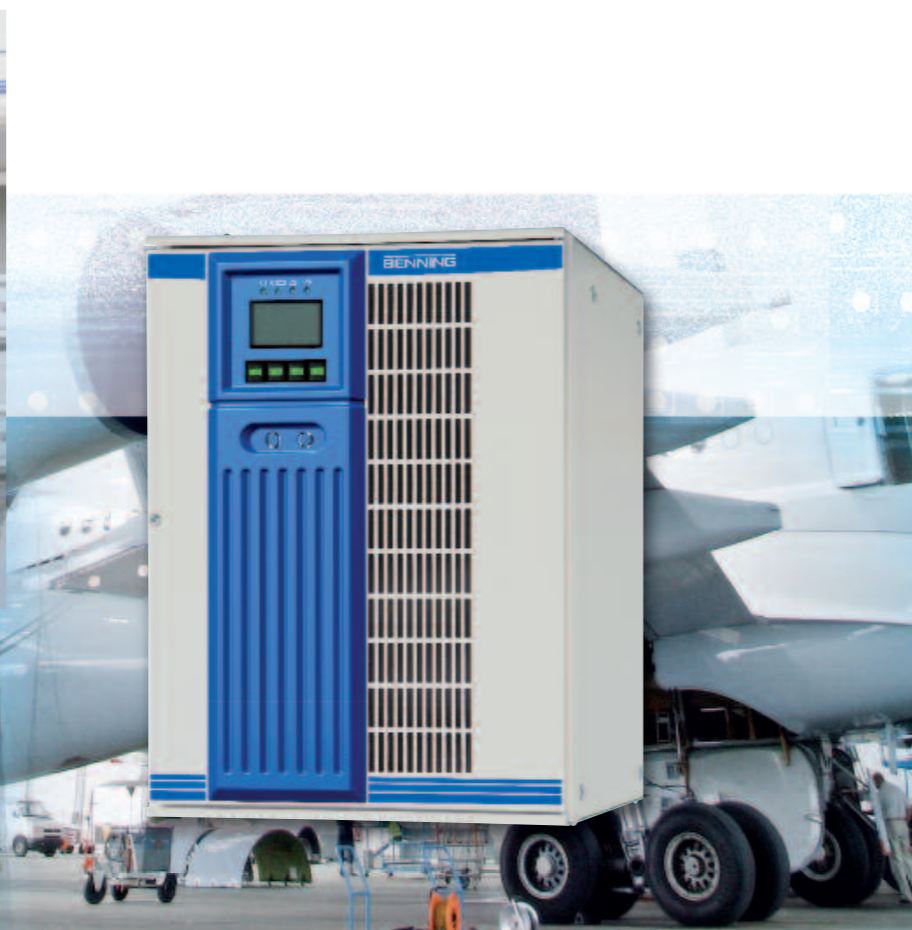
Fig. 5: ADC wall cabinet I with LCD monitoring and control panel (max. output power 1200 W)