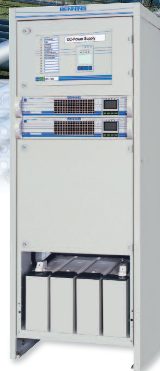
Fig. 7: Combination cabinet with two 19 inch ADC rectifiers and monitoring system MCU 2500

ADC 19 inch versions are the perfect choice to build up complete DC power systems in floor cabinets or together with valve regulated batteries, in combination-cabinets.