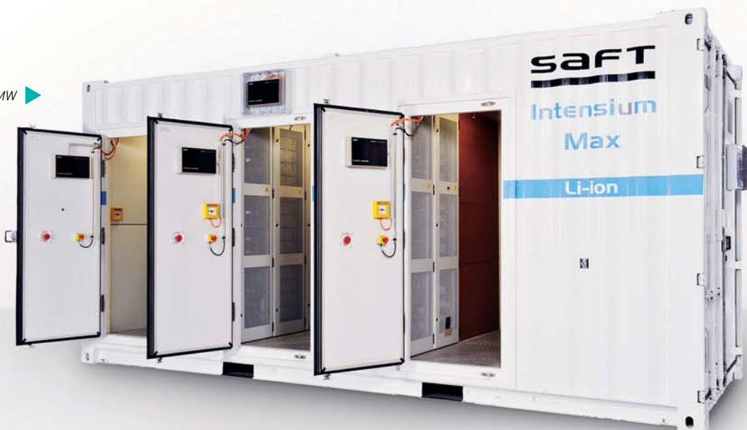
Saft Intensium® Max, 1 - 10 MW ▶

Two Saft Intensium® Max 20E containerised energy storage units are part of a renewable energy storage system on the Big Island of Hawaii in the United States designed to increase the Hawaiian grid's ability to integrate more renewable energy. They will help reduce output power volatility and optimise power performance for an expected service life of 15 years or more.