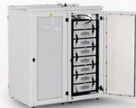
▼ Saft, 700V, 60kWh Energy Storage Unit

Saft solutions were a key element of the European Union GROW-DERS [Grid Reliability and Operability with Distributed Generation using Flexible Storage] project that successfully created a transportable flexible storage system and assessment tool for distribution network management. Field tests of two 50 kW Li-ion batteries showed the benefits of energy storage and the grid operators involved were positive about the opportunities.