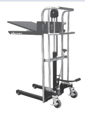
Table dimension: 650 x 576mm