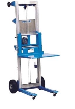
Table dimension: 580 x 560mm