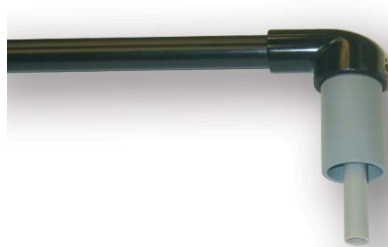
Spacer Tubes A, B, C, D, E, F, H