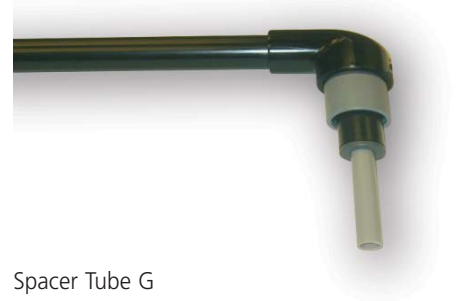
Spacer Tube G