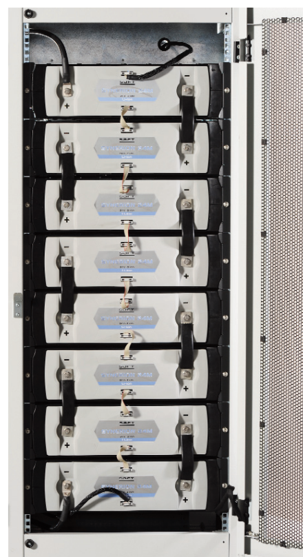
Intensium® Flex – Rack-mount lithium-ion battery systems incorporating Synerion® modules

Intensium® Flex integrates battery management, temperature management and safety functions, as well as power management and power conversion facilities, within a stand-alone rack-mountable battery system. Saft's experts can also provide system qualification and pre-testing services at the early stages of your project, as well as delivering turnkey installations and commissioning services.