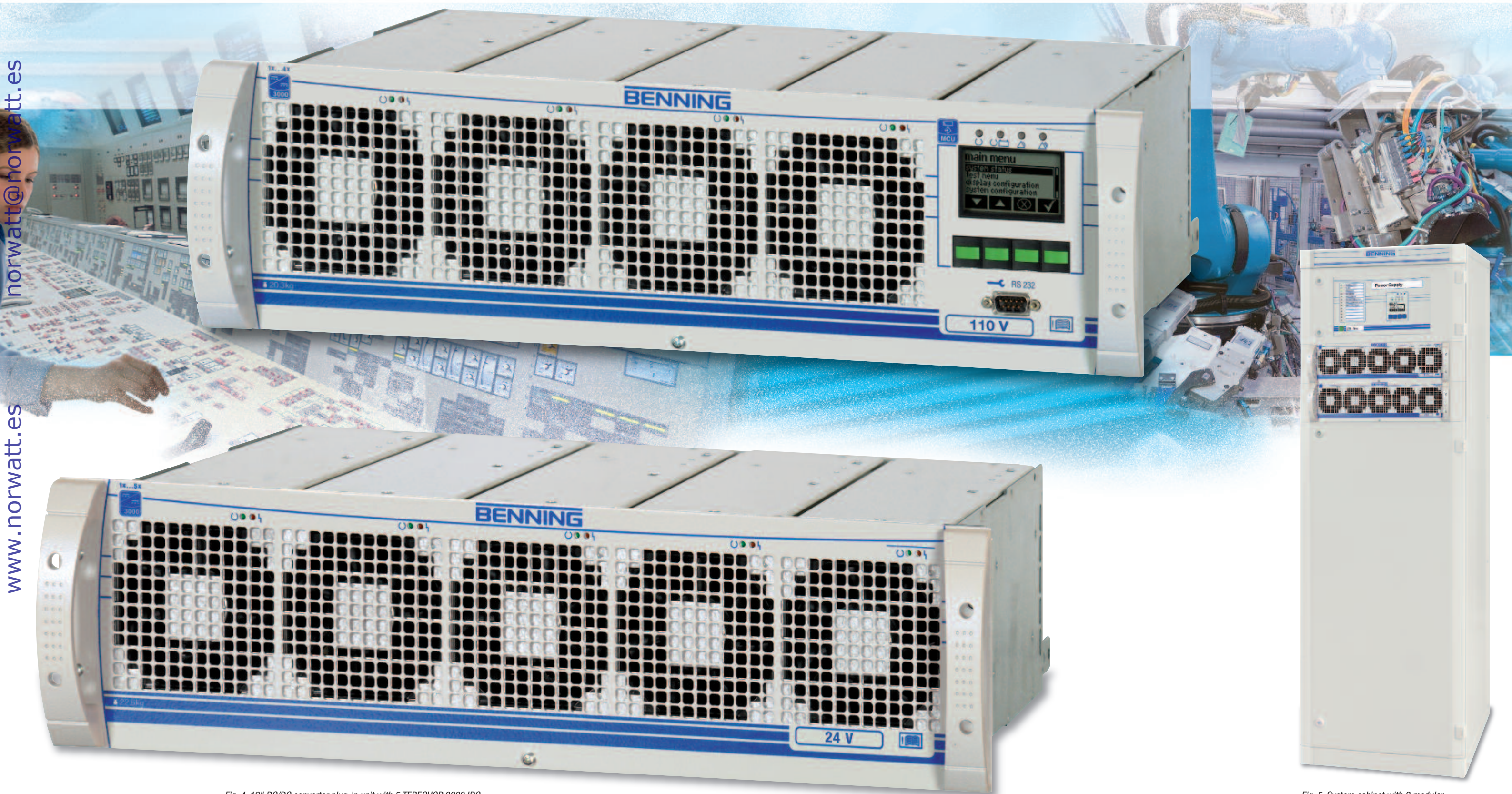
Fig. 3: 19" DC/DC converter plug-in unit with 4 TEBECHOP 3000 IDC modules and MCU 2500 remote monitoring, output voltage 110 V, output current 80 A