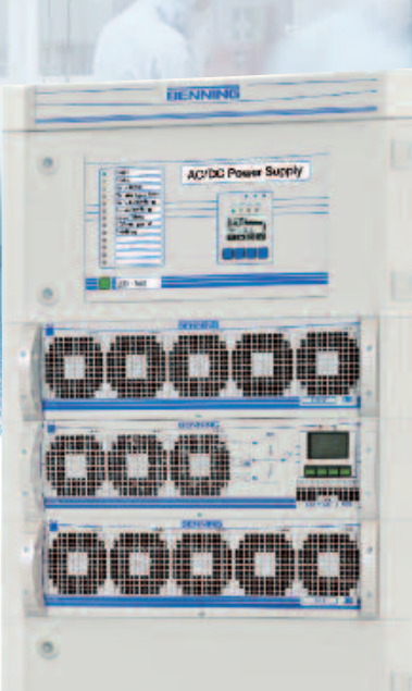
Fig. 2: Combined power supply system (similar to block circuit diagram Fig. 1)